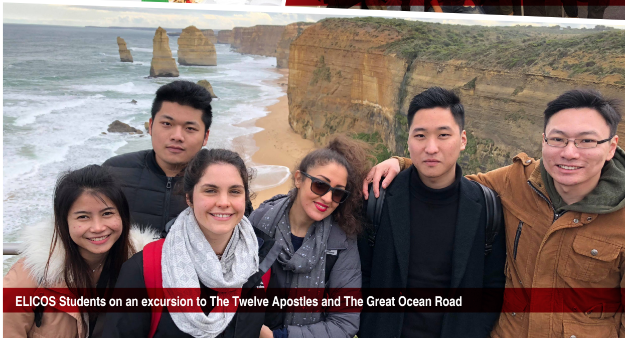
ELICOS Students on an excursion to The Twelve Apostles and The Great Ocean Road